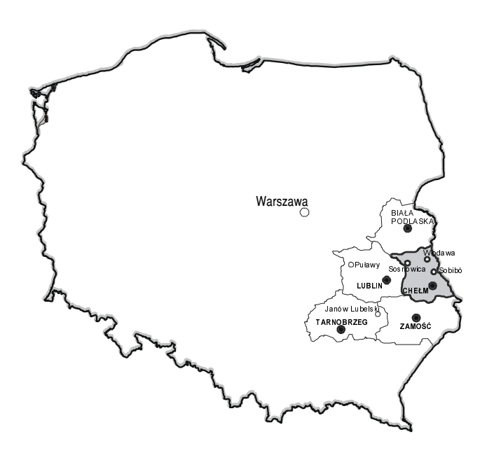
Figure 1. Map showing area of study: five districts in the Lublin region.

Seroepidemiologic examinations of humans. Examinations were carried out in 1,327 people employed in forestry from five districts and in 86 farmers from two districts of the Lublin region (Fig. 1). The administrative division before the reform introduced in 1998 is taken into consideration throughout the paper. 34 office workers